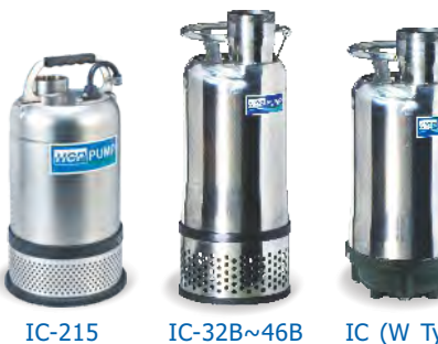
IC-32B~IC-610 • Chrome Steel